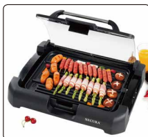
Secura 1700W Electric 2-in-1 Grill Griddle