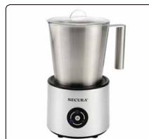
Secura Automatic Milk Frother