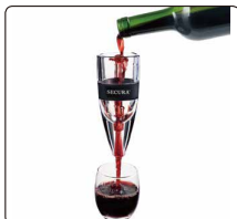
Secura Premium Wine Aerator