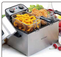
Secura Triple Basket Electric Deep Fryer