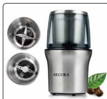
Secura Electric Coffee and Spice Grinder