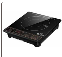
Duxtop Portable 1800W Induction Cooktop