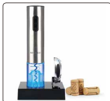
Secura Electric Wine Opener